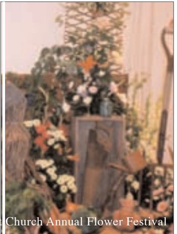
• Great success... Duffield Baptist Church Annual Flower Festival