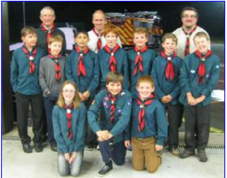
Picture shows:members of the new Scout Troop and their Leaders at a recent visit to Duffield Fire Station”