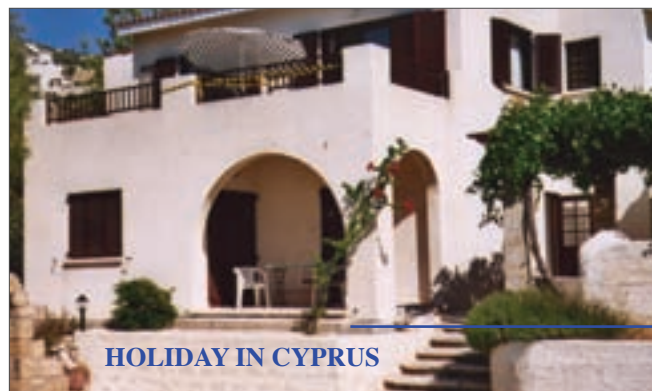
HOLIDAY IN CYPRUS

www.duffieldroaddental.com 498 Duffield Road • Allestree Derby • DE22 2DJ