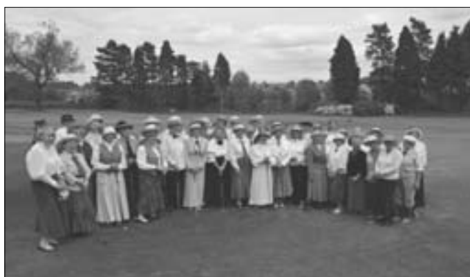
The Ladies of Chevin Golf Club had a wonderful week celebrating their Centenary and really entered into the spirit of their first hundred years with a string of events.