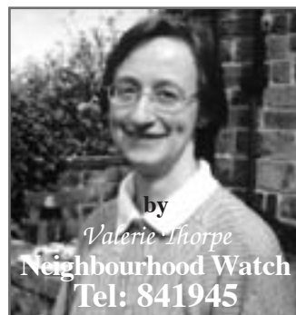
by Valerie Thorpe Neighbourhood Watch Tel: 841945

The police weigh all the facts when investigating an incident. This includes the fact that the intruder caused the situation to arise in the first place. The police have a duty to investigate incidents involving a death or injury and things are not always as they seem. On occasions people pretend a burglary has taken place to cover up other crimes such as a fight between drug dealers.