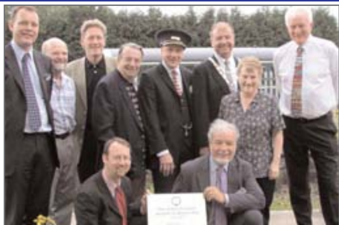
• Representatives of the Friends of the Derwent Valley Line, Central Trains, WyvernRail and Duffield Parish Council display the adoption plaque at Duffield while WyvernRail's train waits in the branch line platform behind them.

"They have already worked miracles on their own platform at Duffield and we look forward to their applying more of their Ecclesbourne Valley magic to the main line. Within the next few years Duffield will become a key interchange for the Derbyshire Dales and the Peak District.