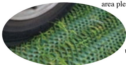
An example of the type of surfacing to be used at Eyes Meadow

The Parish Council is currently working on the provision of a "Green Car Park" at Eyes Meadow. The area indicated by the newly constructed fencing opposite the Cricket Pavilion will it is hoped be completed sometime next spring and accommodate up to 60 cars. Initial enquires have identified a surfacing which will allow the grass to mesh with the surfacing creating a natural appearance to the site which will enhance the area. A Planning Application for the new surfacing will be made in September. If you have any comments on the provision of the new car park area please contact the Clerk