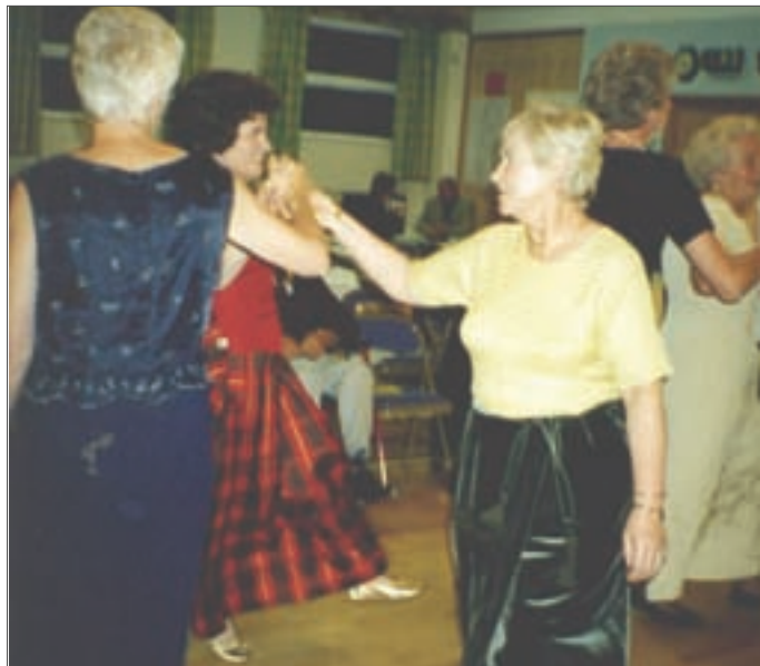
Dance Scottish week 12-18 th September 2009.

You don't have to be a Scot or even visit Scotland to start enjoying social dancing from the first session.